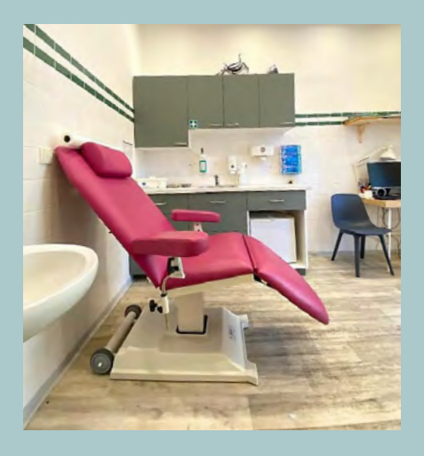
5. THE CLINICAL ROOM