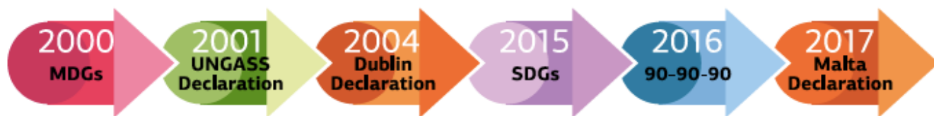
Figure 1. Timeline of key policy decision regarding HIV services for KAPs

International targets related to HIV/AIDS have been defined and set high. The United Nations Sustainable Development Goals call for an end to HIV epidemics by 2030, while UNAIDS and the international community call for 90-90-90 targets by 2020. Harm reduction programs play an important role in achieving 90-90-90 goals among people who use drugs.