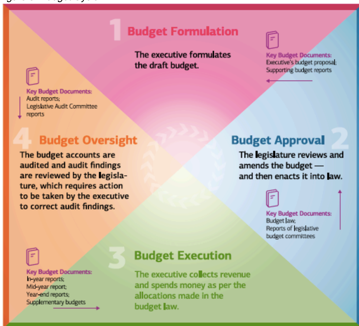
Figure 5. Budget Cycle

Budgets cover a fixed period of time, called a fiscal year. In most countries (70% of International Monetary Fund countries), the fiscal year for the public budget is the same as the calendar year, but this does not have to be the case.