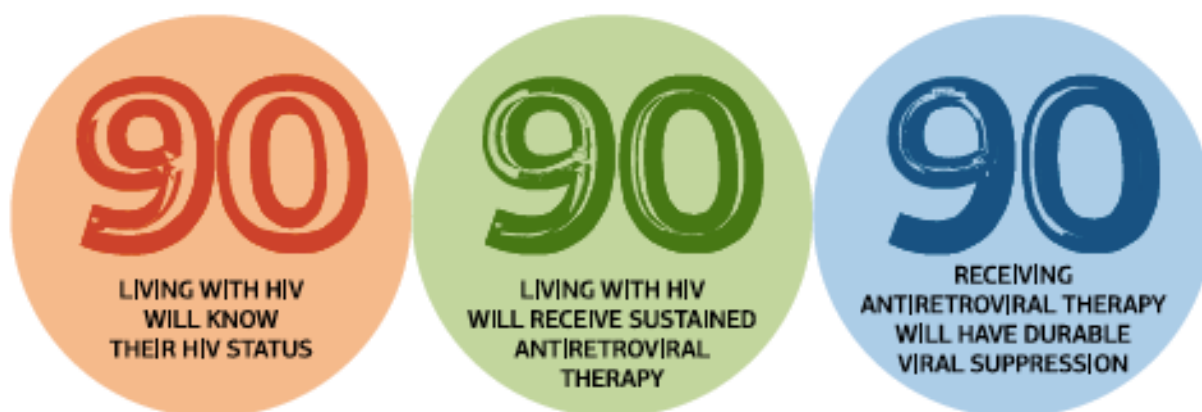
Figure 2. The 90-90-90 targets

International targets related to HIV/AIDS have been defined and set high. The United Nations Sustainable Development Goals call for an end to HIV epidemics by 2030, while UNAIDS and the international community call for 90-90-90 targets by 2020. Harm reduction programs play an important role in achieving 90-90-90 goals among people who use drugs.